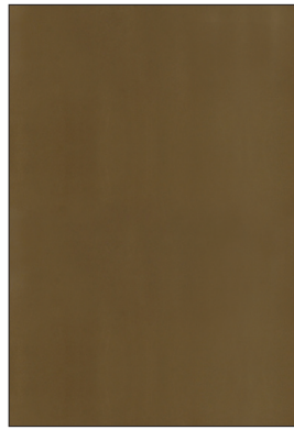
*BRONZE - B