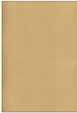
BRASS - BR