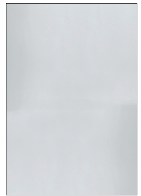
STERLING - ST

* Indicates a fusion of metal and fiberglass technology that will patina naturally over time.