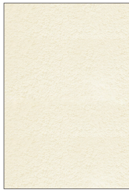
LIMESTONE - LS