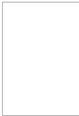
SHINY WHITE - SW