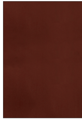
*CAST IRON - I