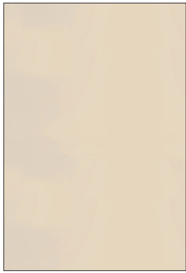
BONE - BN