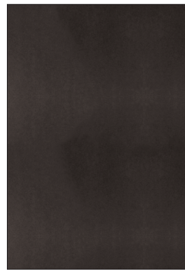
*MATTE BLACK - MB