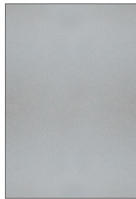
*STAINLESS STEEL - SS